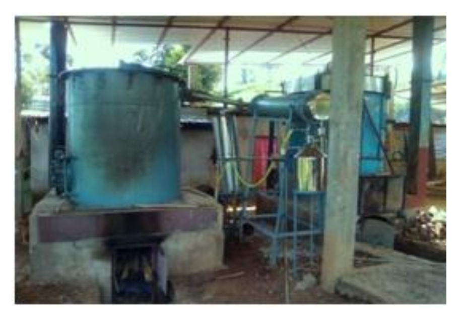
Figure 4: Improved Field Distillation Unit installed at Farmers Field