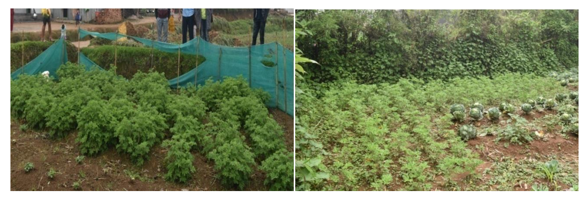
Figure 3: Geranium Nursery in Farmers Field at Cham Cham