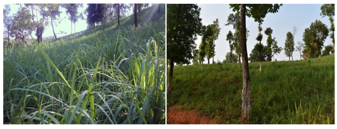
Figure 1: Citronella Plantation at ByrwaFigure 2: Lemongrass Plantation at Byrwa